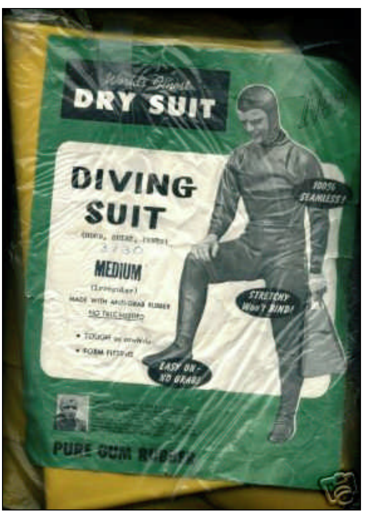
The inner packaging of a Skooba "Totes" suit