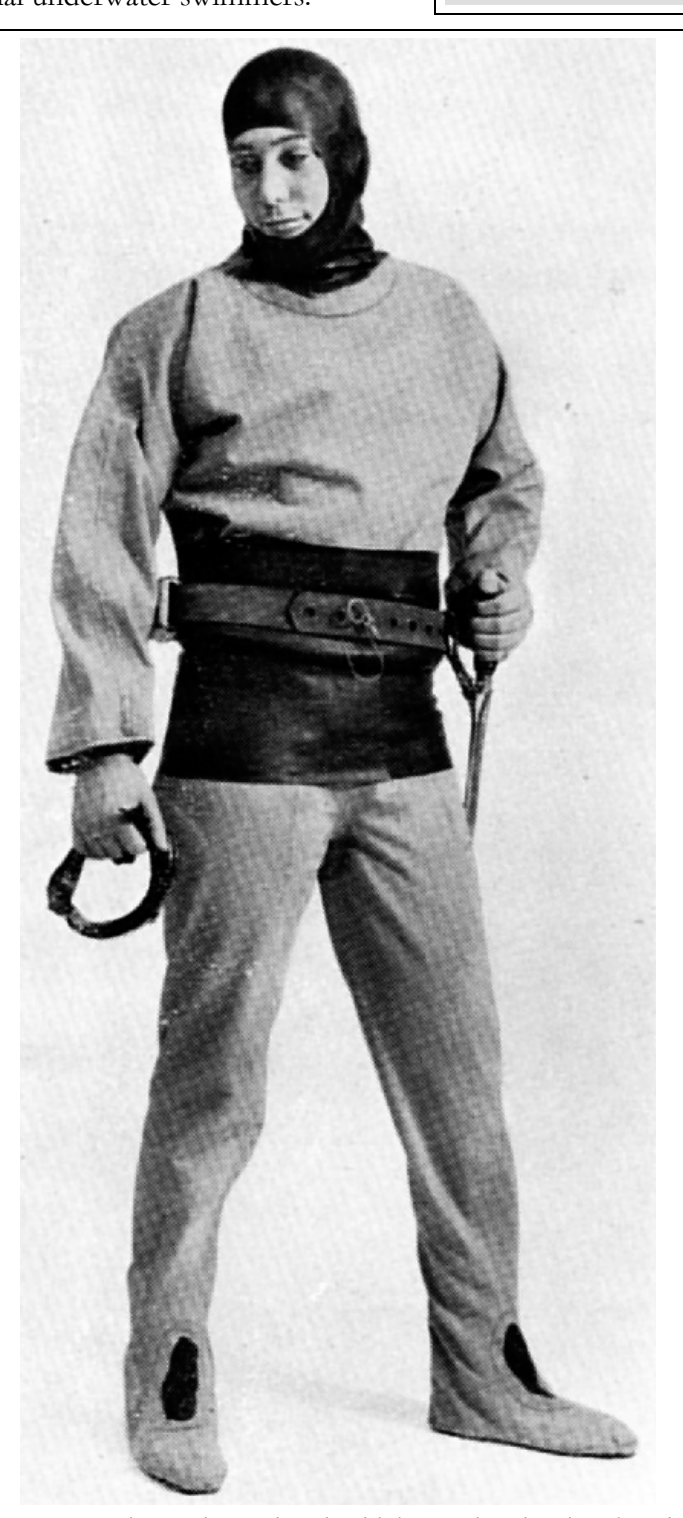
"Frogman" heavy-duty swimsuit with braces, hood and neck seal