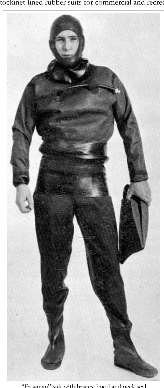
"Frogman" suit with braces, hood and neck seal